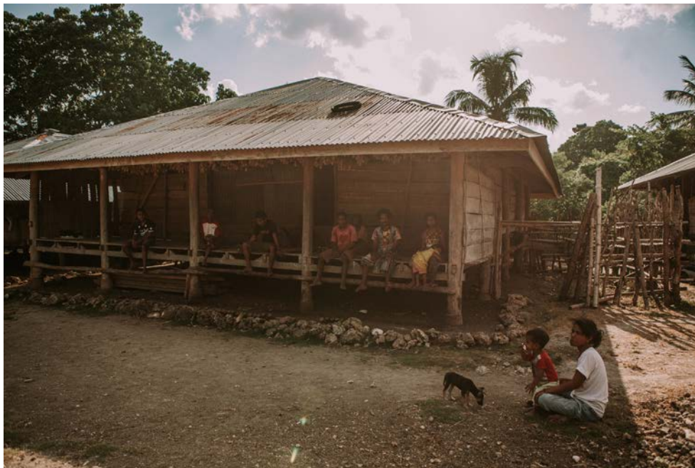
People in the Remote area in East Sumba Region, Lapinu, Matawai Katingga Village