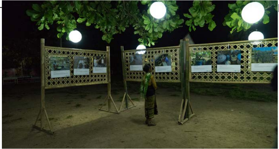
Sampel Exhibition Concept and Realisation