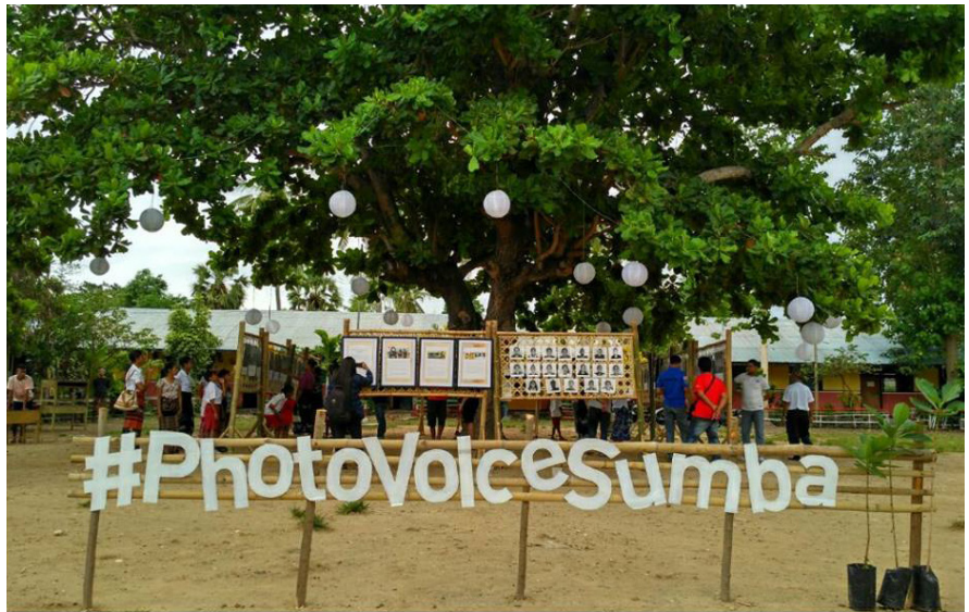
| Doc.PhotoVoiceSumba by SekarKawung 2017