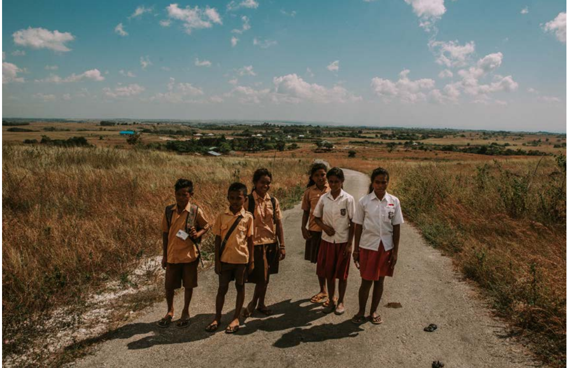
Kids going home from their school without shoes, Matawai Katingga, Kahaungu Eti, East Sumba

We will lend them cameras and let them take pictures of anything in their surroundings as we continue to hone their photography skills through a series of training. The photos are expected to capture real problems in their