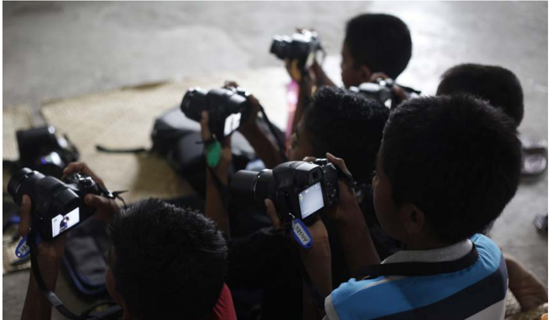
Kids learn How to use Camera

There are many benefits of conducting this project: First, by participating in this project, they will be encouraged to do something new, which changes their day-to-day habits. They will learn and develop new skills. From an educational point, this is a real chance for them to progress.