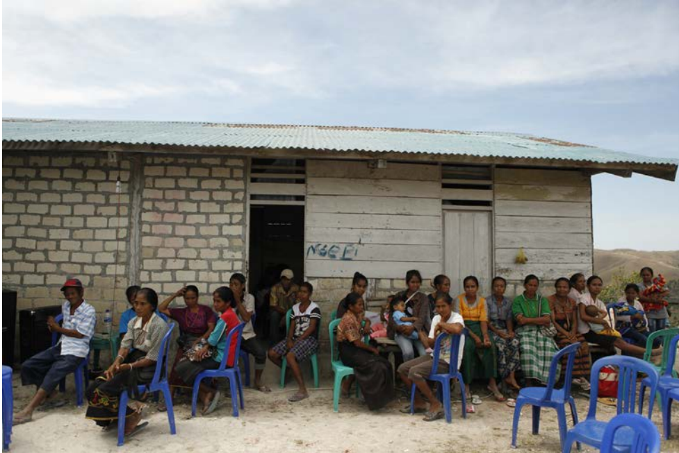
People in the Remote area in East Sumba Region, Ngadulangi Village