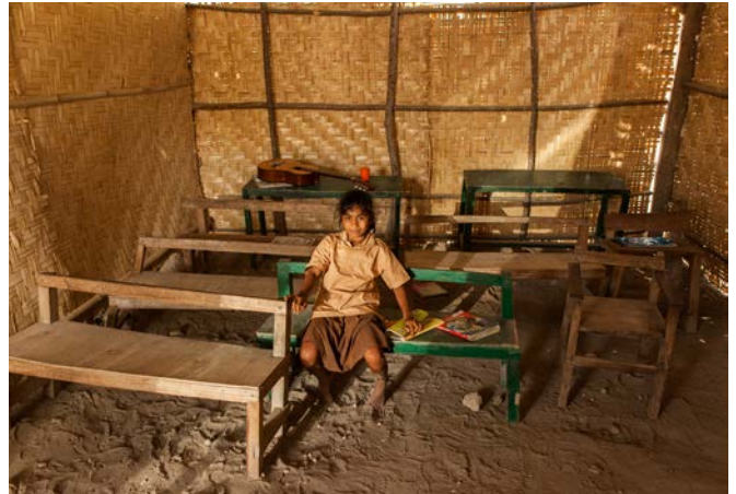
Photo can bring data to analyze about what the urgent needed on site. East Sumba 2017-2018